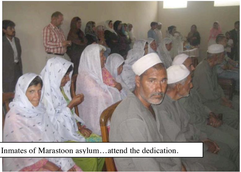
Inmates of Marastoon asylum...attend the dedication.